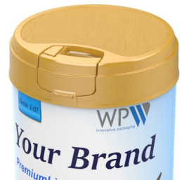
Unique Tamper-Evident tab