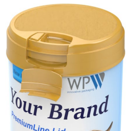
Robust safety clip