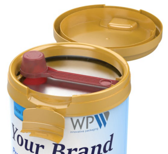
Convenient scoop docking